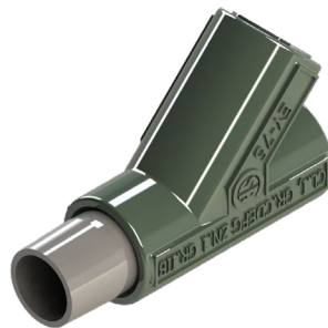
3/4" NPT Vertical Seal fitting with nipple; P/N: 30192AL

Sealing fittings are required within 18 inches of each enclosure entry used. These seal conduits from passing hazardous vapors or propagating flame. Sealing fittings are installed inline with conduit, then filled with sealing compound once wiring has been installed and verified. Downstream junction boxes containing Intrinsically Safe circuits may be serviced without danger.