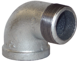
150# galvanized iron