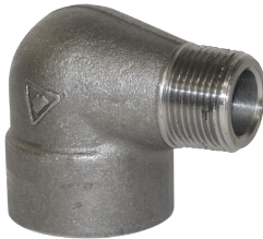
3000# forged steel