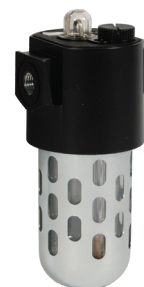
transparent bowl with guard

FRLs are designed for air service only, unless otherwise indicated.