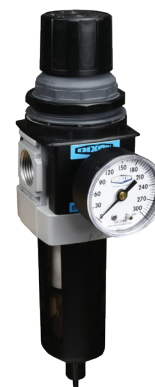
with transparent bowl

NOTE: See pages 322-326 for accessories. SCFM ratings at 100 PSIG inlet pressure.