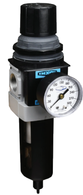
with transparent bowl

NOTE: See pages 312 - 316 for accessories. SCFM ratings at 100 PSIG inlet pressure.