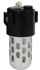
transparent bowl with guard

FRLs are designed for air service only, unless otherwise indicated.